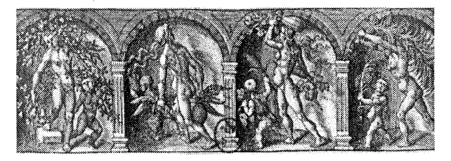
Figure I (Phot. Bibl. Nat. Paris)

The engravings in the early volumes of De Bry's Great Voyages and the woodcut illustrations to Thevet's Singularitez de la France Antarctique can probably be counted among the iconographical sources of the Album des habitans du Nouveau Monde by Antoine Jacquard, a French engraver from Poitiers whose activities can be situated between 1613 and 1640 (Hamy 1907 a). This set of engravings represents men, women and children of the New World, each figure or pair of figures set within a classicising architectural framework. On the frontispiece and the first two plates we see pairs of children at play. The following two plates are of naked women and children dancing together in pairs (Fig. I). The remaining eight plates, however, are of men, each occupying a separate niche, depicted in a variety of aggressive poses. Some of them are engaged in acts of cannibalism; others carry human or animal victims over their shoulders; one is flayed, his skin dangling over his shoulder; and one has been reduced to the macabre figure of a skeleton (Figs. II and III).