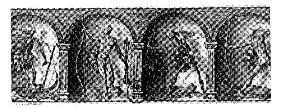
Figure III